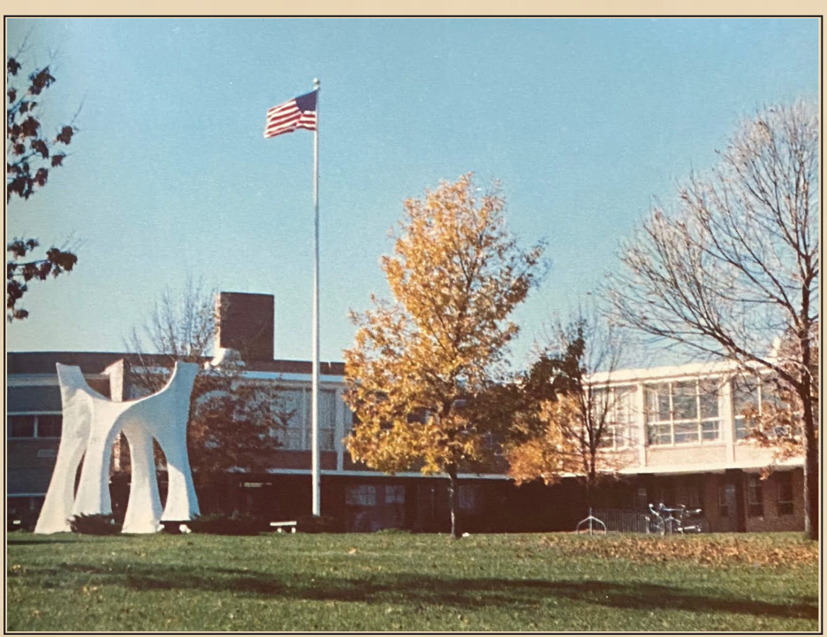
1982: Mounds View High School before many renovations with the MV sculpture out front.

An Exploration of Mounds View High School's Long History